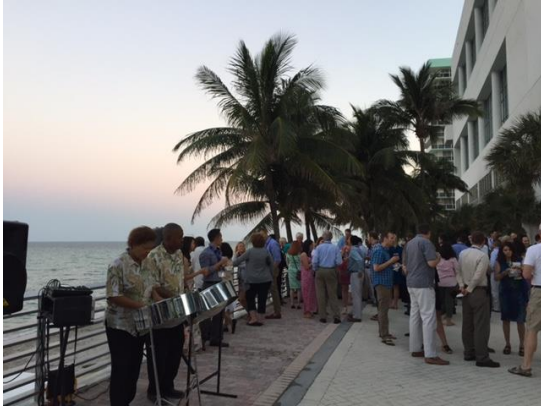
AUR Welcome Reception