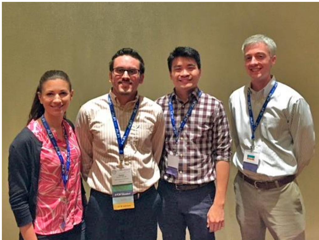
Incoming A 3 CR 2 executive committee at AUR 2017 in Hollywood, FL.