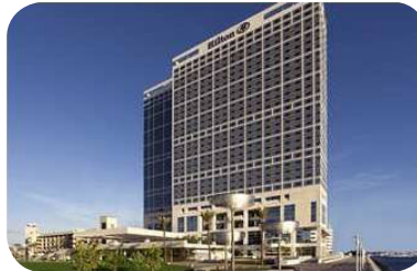
Hilton San Diego Bayfront Hotel March 23-26, 2010

The problem solving roundtable allowed a frank discussion of the upcoming changes in the Ameri-