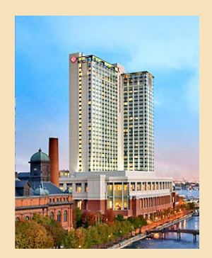
Baltimore Marriott Waterfront

The Executive Committee eagerly invites you to attend and participate in the A<sup>3</sup>CR<sup>2</sup> program at the 2014 meeting of the AUR! We encourage new chief residents to actively engage in the various leadership and networking opportunities that will be available in Baltimore. See you at the Inner Harbor!