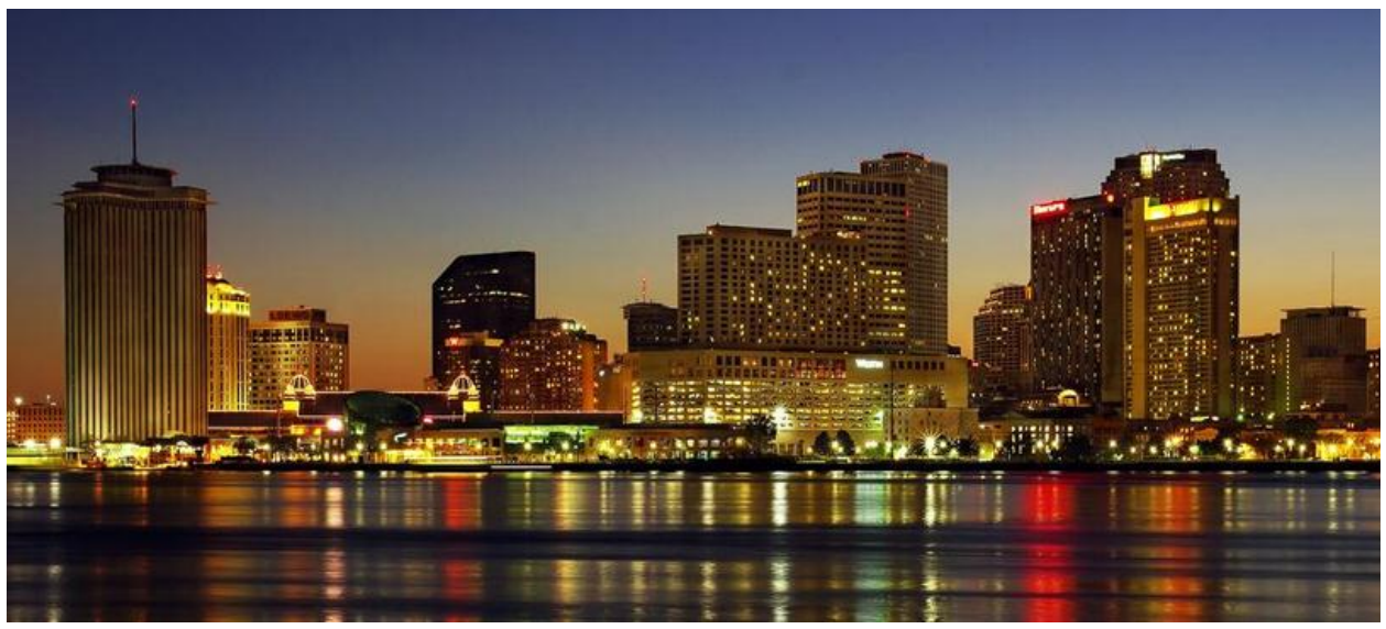
See you at AUR 2015 in New Orleans!

Next Steering Committee meeting will be held at RSNA in Chicago on Tuesday December 2, 2014 from 3:00-4:30 p.m. in room N138. All are encouraged to attend!