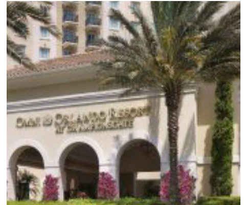
Omni Orlando Resort at ChampionsGate Orlando, Florida Site of 2018 Annual Meeting of the Association of University Radiologists May 7-10, 2018