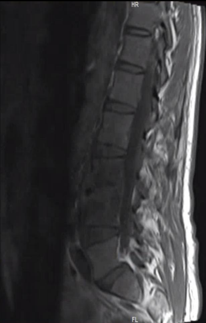
Sagittal T1 pre-contrast