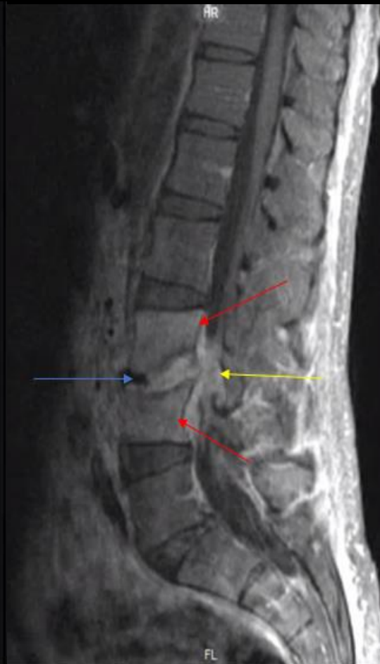
Sagittal T1 post-contrast